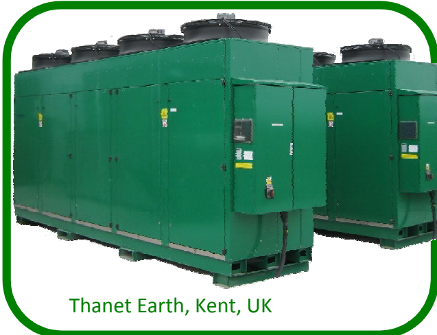
Thanet Earth, Kent, UK