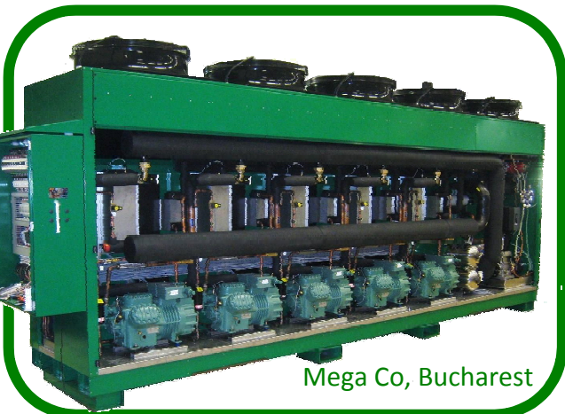
Mega Co, Bucharest