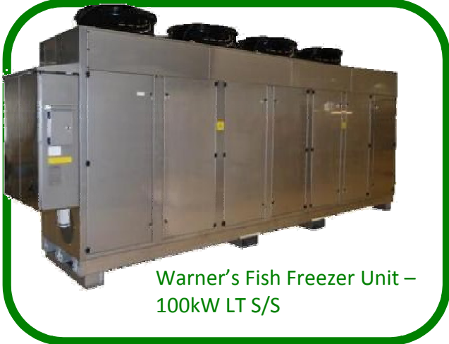
Warner's Fish Freezer Unit – 100kW LT S/S